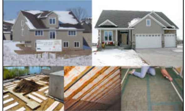
Earth Storage Radiant Ceiling Warm Floors Energy House III In Elk River, MN