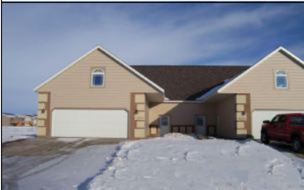
5,438 square foot Duplex with Earth Storage System in the lower level and Radiant Ceiling System in the upper level.